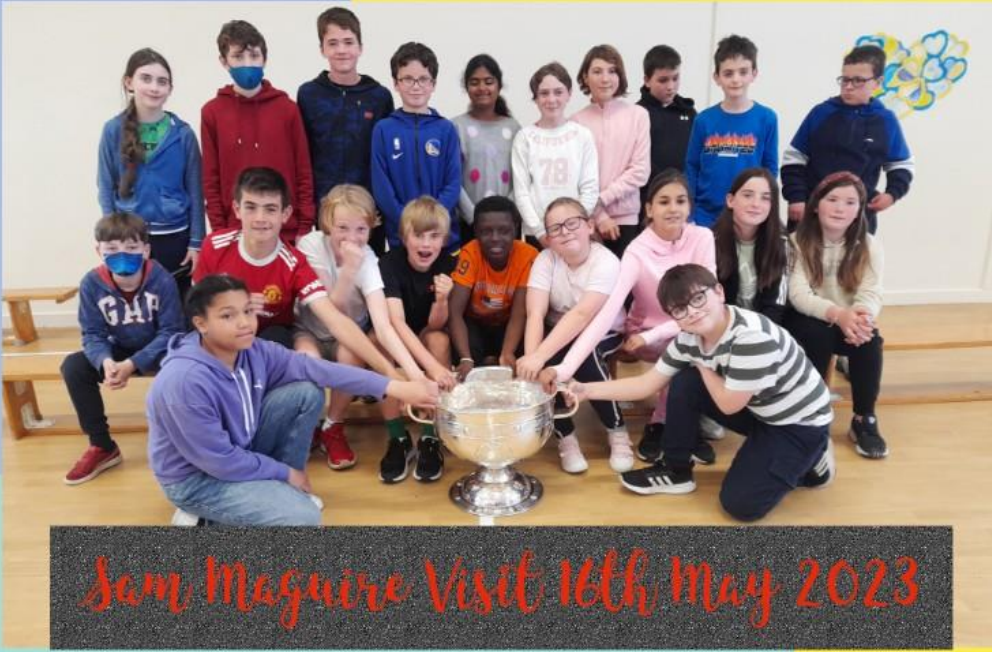
Sam Maguire Visit 16th May 2023